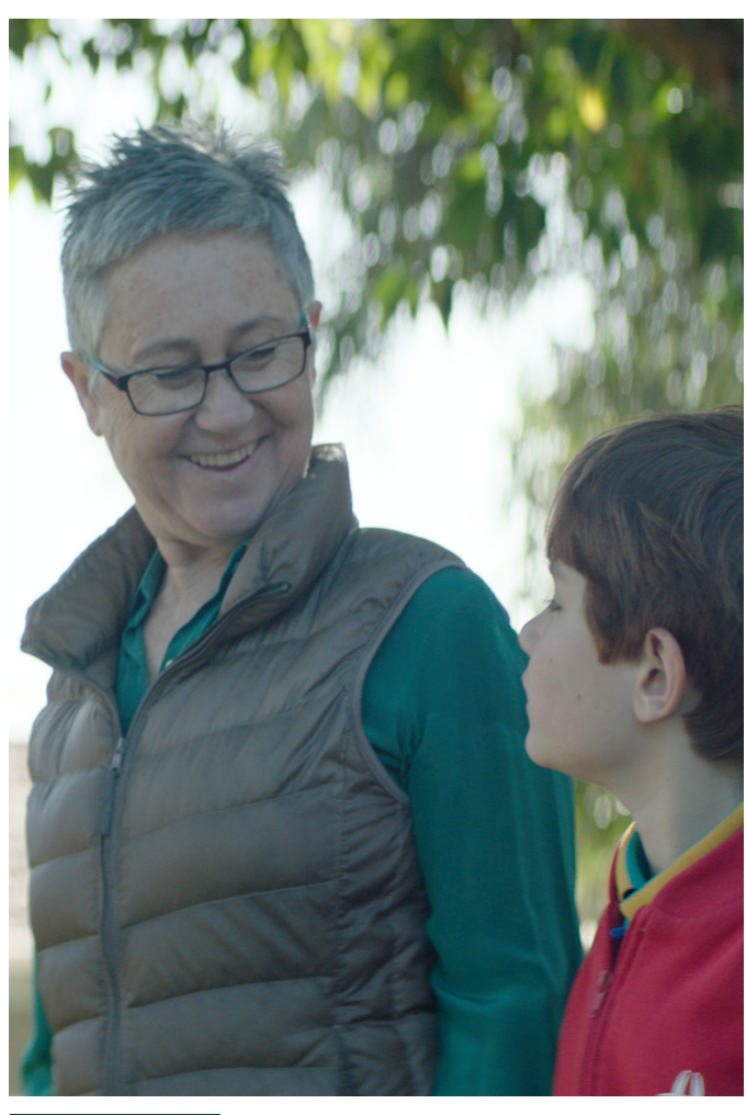
13 Peer Work Hub, 2016, http://peerworkhub.com.au/wp-content/uploads/2016/05/Business-Case.pdf, p10.

Provide $166 million to fund a two-year national peer workforce trial with 1,000 places from 1 July 2019.